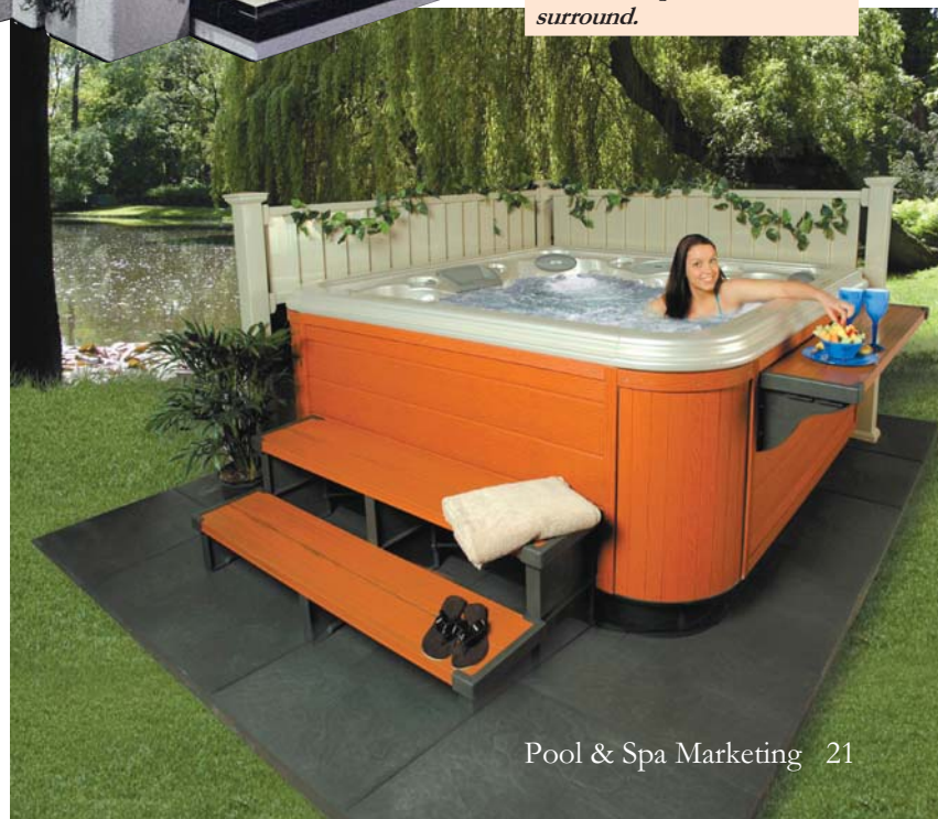
Below: Spa surround systems from Outback Essentials feature a spa pad with the look of slate that co-ordinates with other components in the surround.